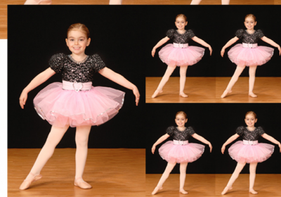
1 8x10, 1 5x7, 4 3x5s + 4 wallets: $50.00

ALL ORDERS ARE REQUIRED TO BE PAID IN FULL UPON ORDERING. ORDERS NOT PAID IN FULL WILL NOT BE PRINTED !