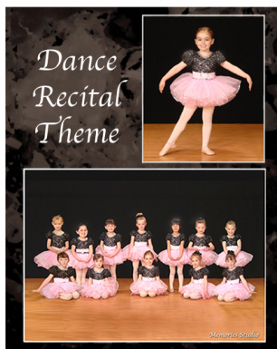
Memories Mate: $25.00

PLEASE CIRCLE YOUR CHOICES USE A SEPARATE FORM FOR EACH CLASS