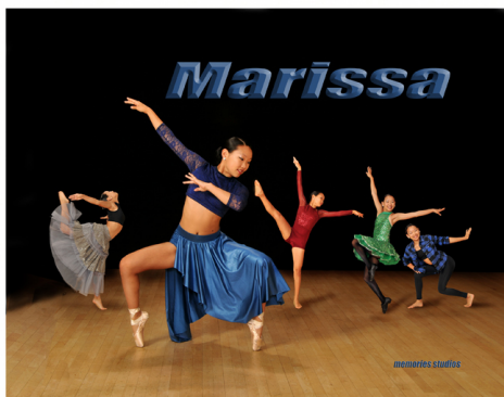
11x14 Composite Wall Plaque: $150 Up to 5 Images w/Dancer's Name! group letter dance name