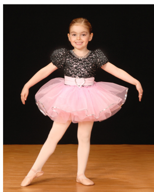
8x10 $ 25.00