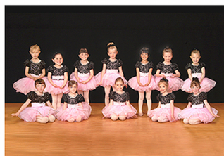
5x7 group only-no solos $10