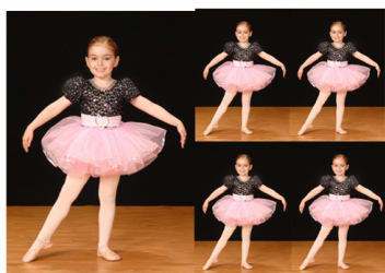
1 5x7 and 4 wallets $ 25.00